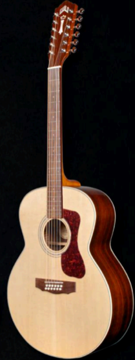
F-1512 Jumbo 12-String