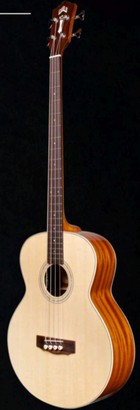
B-140E Acoustic Bass w/Fishman Sonitone Bass Pickup