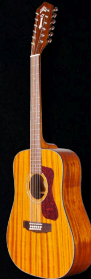
D-1212 Dreadnought, 12-String