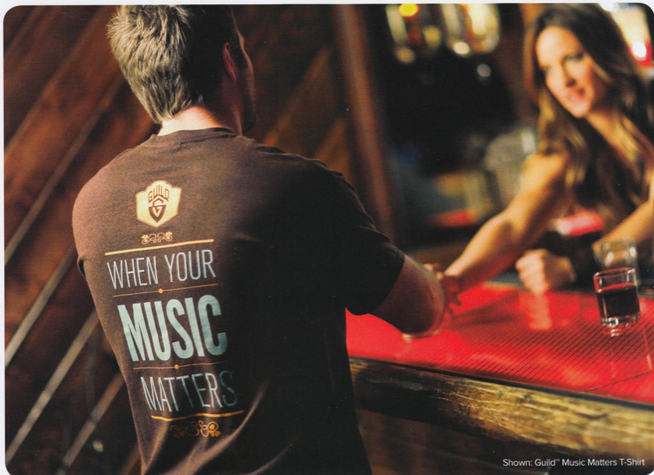
Shown: Guild™ Music Matters T-Shirt