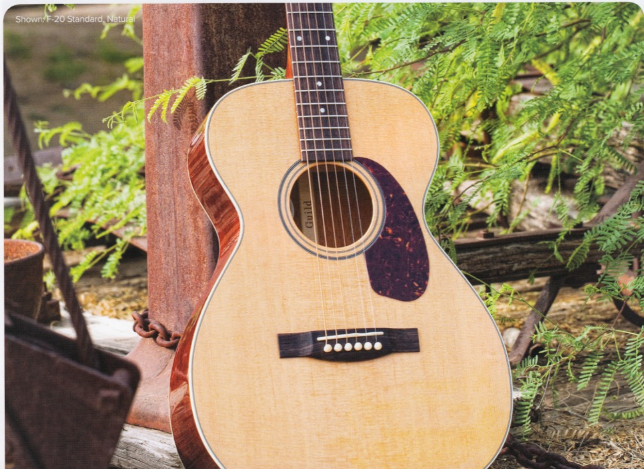
Shown: F-20 Standard, Natural