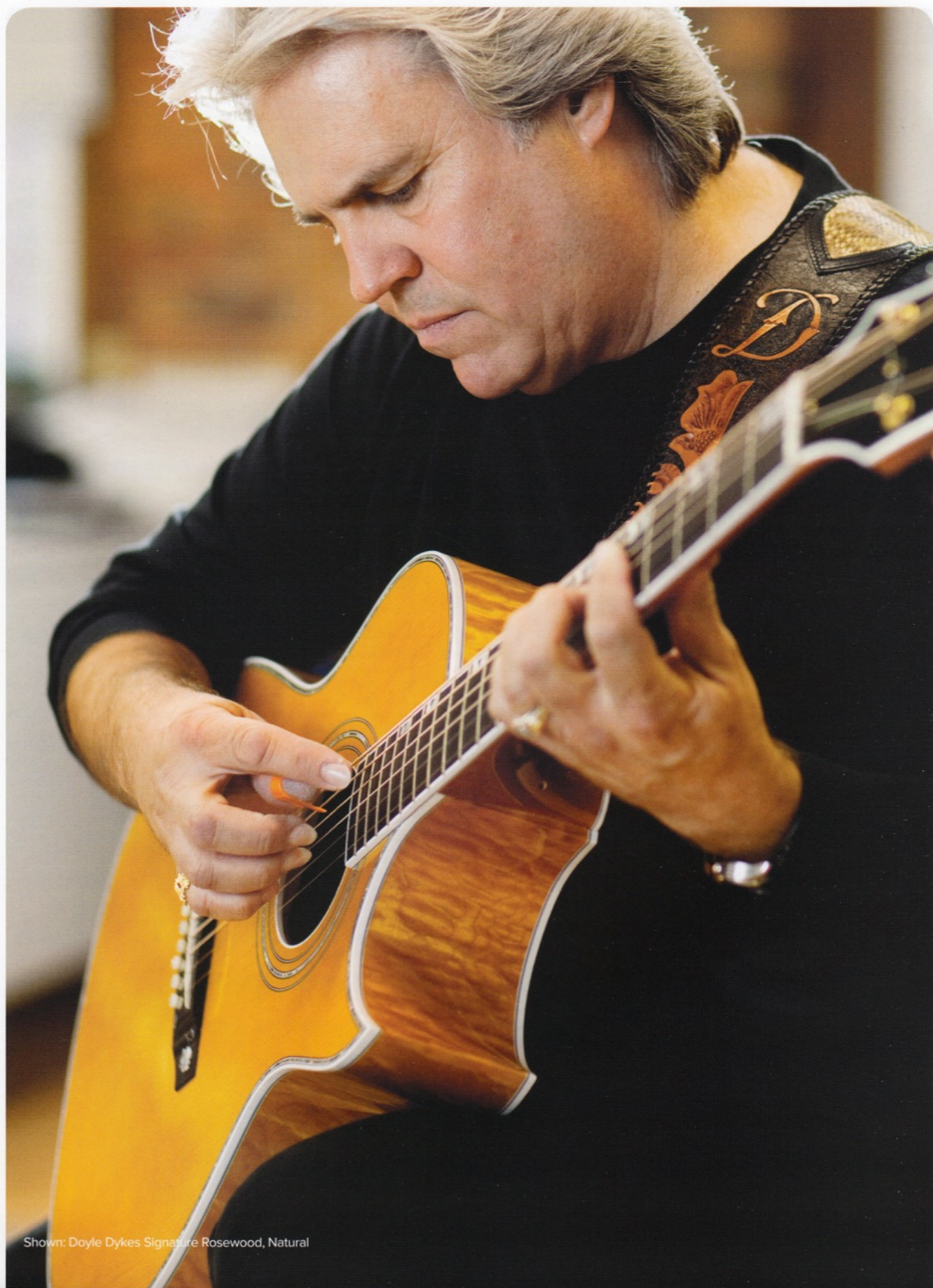
Shown: Doyle Dykes Signature Rosewood, Natural