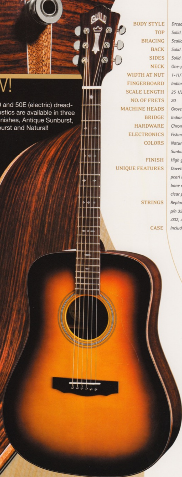
GAD-50 Antique Sunburst