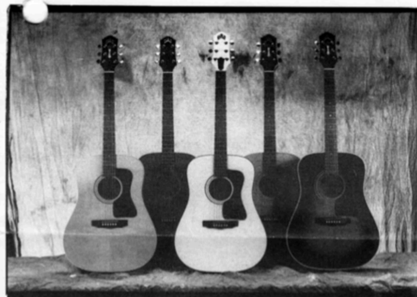
D-30 D-15 D-25 D-40 D-50

Guild acoustic guitars are handmade in America, by Guild craftsmen with years of experience building the world's finest production guitars. The Dreadnought guitar, long the favorite of flatpickers, offers a prominent, punchy bass, with a clear ringing treble. The GF-series guitars, with their larger body, offer a richer, warmer tone, with excellent balance and projection. The JF-series jumbo guitars offer a large, strong bass, with a soft and even treble, and excellent sustain.