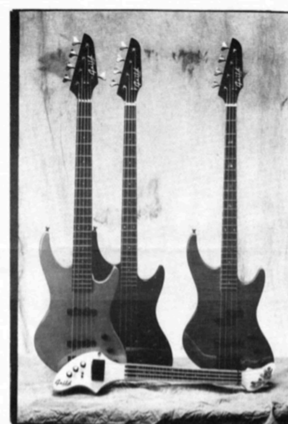
SB-605 SB-602 Ashbory SB-902

The Guild Pilot Basses are recognized throughout the music world as the best-selling bass guitars in America. Lightweight Poplar bodies coupled with satin finished maple neck result in an instrument with incredible sustain, brilliance and punch.