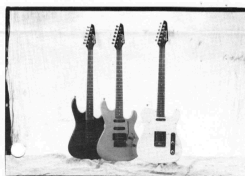
Liberator Detonator T-250

Guild solid-body electric guitars are built to the same exacting standards as the famous Guild acoustic guitars. The Detonator and Liberator feature the Guild non-locking tremelo system. Crafted from solid brass and steel, the Guild tremelo, combined with Sperzel Trim-lok tuning machines, can stand up to the most extreme tremelo technique, and consistently stay in tune.