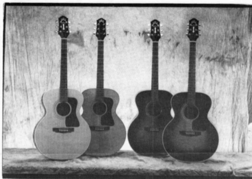
GF-40 GF-25 GF-30 GF-50

The GF series of guitars from Guild feature a slightly larger body than a Dreadnought, offering a balanced, even tone, with excellent sustain and projection.