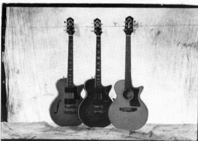
Nightbird Nightingale Songbird

The Nightbird series guitars all feature solid mahogany construction. Standard Nightbirds and Nightingales come with solid spruce tops, as does the Songbird. The Nightbird is also available with a highly figured maple top. The Nightbird features exclusive acoustic chambers in the body, increasing sustain and giving the guitar a warm "presence", unlike standard solid-body guitars. The Nightingale features a carved spruce top with F-holes, revealing the acoustic chambers within.