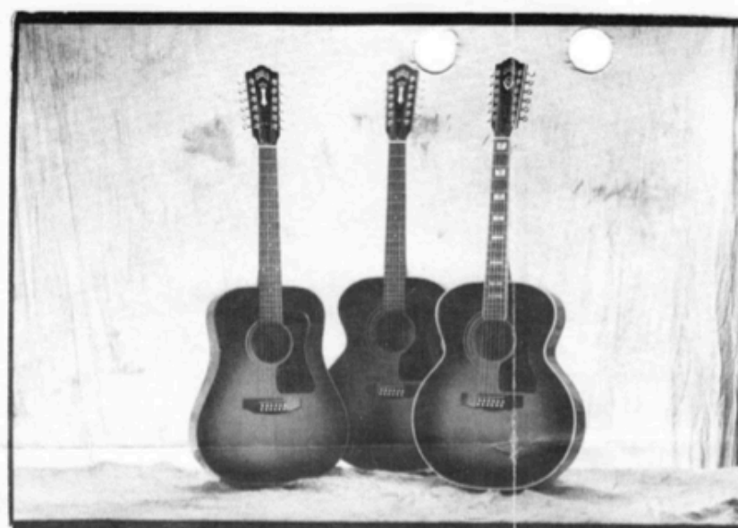
D-25/12 GF-30/12 GF-65/12

Guild twelve-string guitars are famous the world over for their remarkable brilliance, sustain, and balance. Every Guild twelve-string utilizes Guild's dual truss rod arrangement, assuring that each guitar will retain its excellent playability for years. Guild twelve-strings are noted for their loud, singing tone, and excellent projection. The GF-65/12 features the traditional Guild block inlays, multiple binding, and ebony fingerboard.