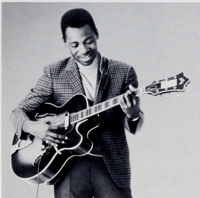
GEORGE BENSON / THE GEORGE BENSON QUARTET