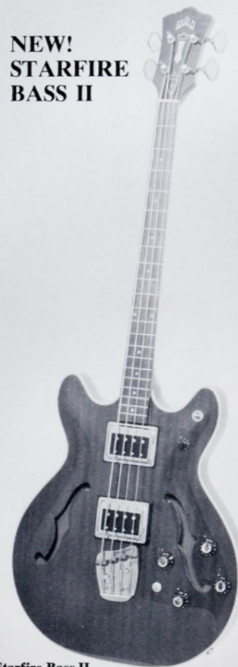
Starfire Bass II