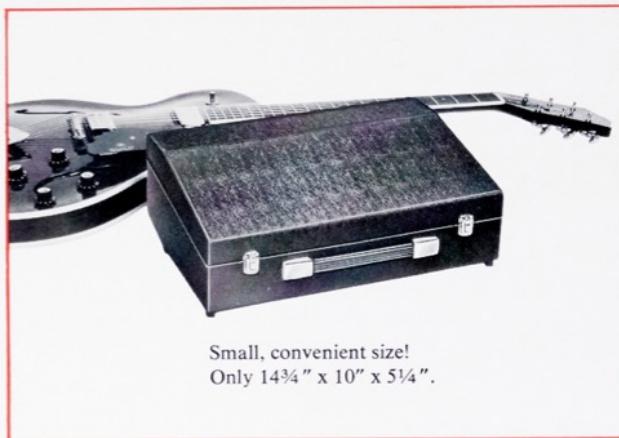
Small, convenient size! Only 14 \frac{3}{4} " x 10" x 5 \frac{1}{4} ".

Has 4 recording heads; separate swell and reverb controls; 2 input jacks, each with its own volume control; separate "halo", "echo" and "repeat" push buttons; off-on motor switch, pilot light and fuse. Handsome fabric-covered cabinet with handle. Size only 14 \frac{3}{4} " wide, 10" deep, 5 \frac{1}{4} " high. Complete with remote control foot switch and plastic cover. Guitar not included.