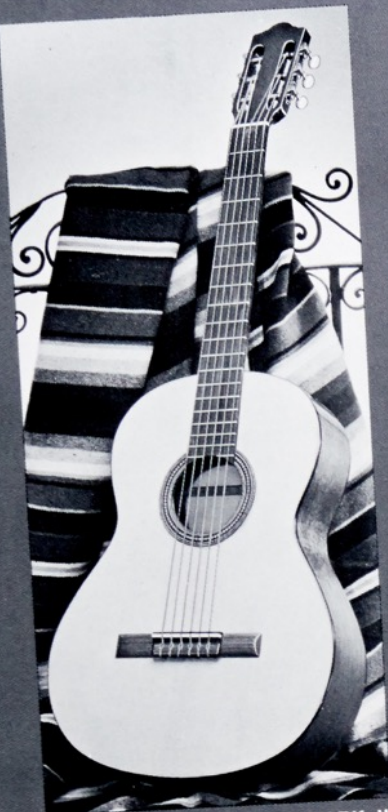
CLASSIC MARK III

■ Conforming to tradition, the body size of all Guild Classic Guitars is 14½" wide, 19½" long and 3½" deep. The neck joins the body at the 12th fret. The scale is 25½" long.