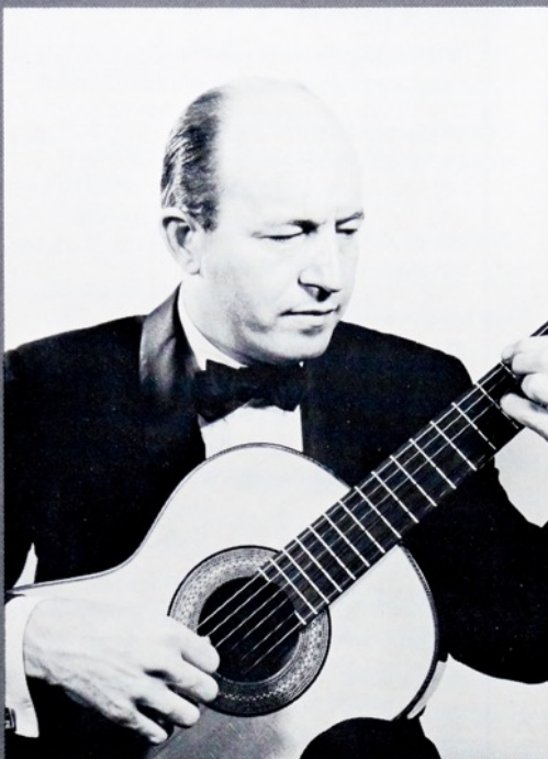
CHARLIE BYRD PLAYS GUILD CLASSIC MARK VI