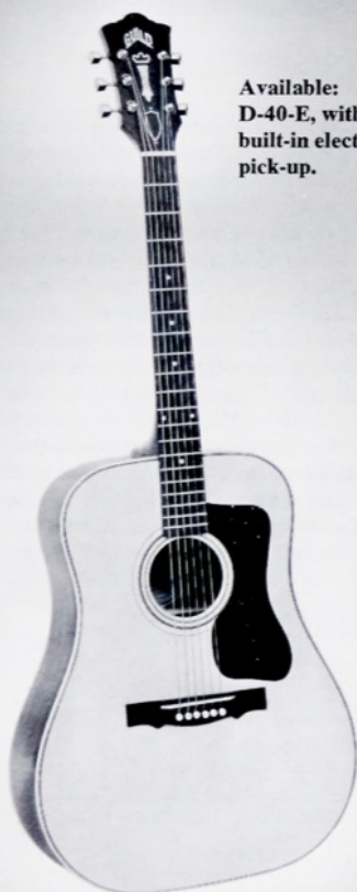
Bluegrass Jubilee D-40

Available: D-40-E, with built-in electric pick-up.