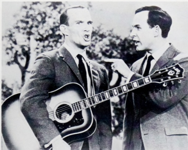
TOMMY SMOTHERS / THE SMOTHERS BROTHERS