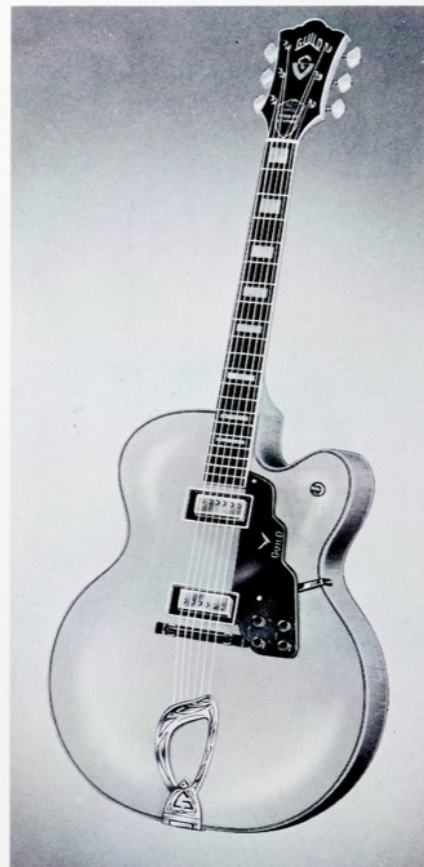
George Barnes Acousti-Lectric Model