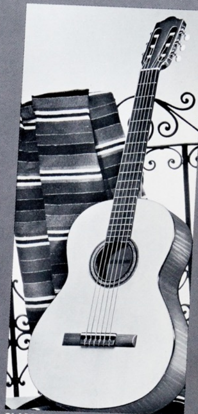
CLASSIC MARK IV