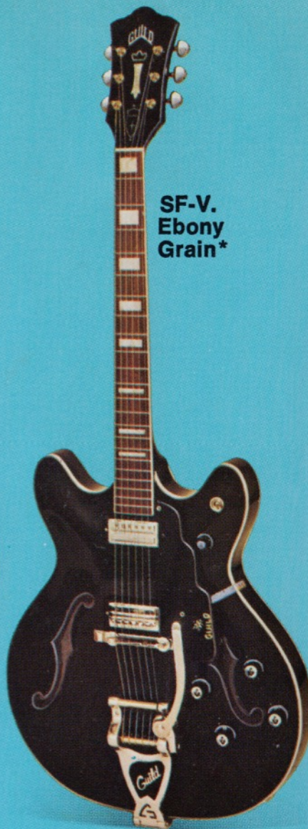
SF-V. Ebony Grain*

All Starfire Guitars: 2" thin body, 16 \frac{3}{8} " wide, 20 \frac{1}{4} " l